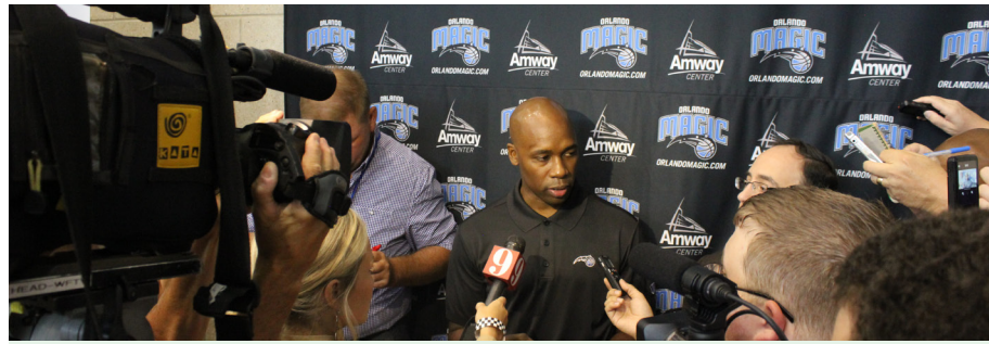
Orlando Magic host media day | Page 5