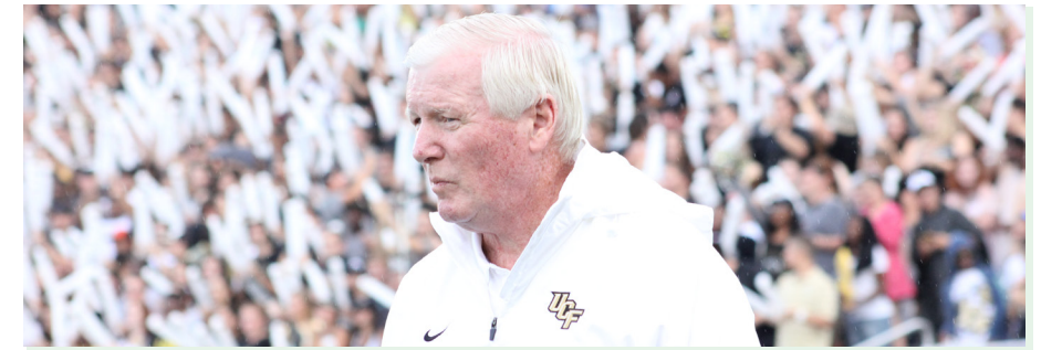
UCF Knights prepare for confrece play | Page 4

"There can be no reasoning, no negotiation, with this brand of evil." —President Barack Obama, at the U.N., on the Islamic State.