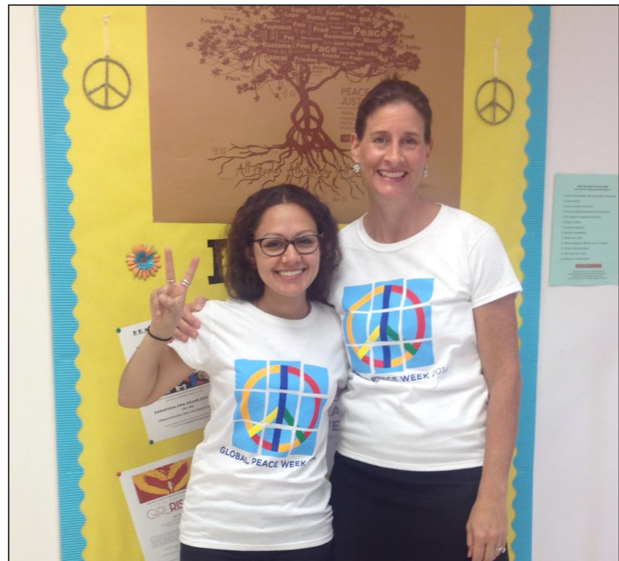
Peace and Justice Initiative Facebook

The peace and justice initiative will be selling Global Peace Week Shirts for $10.