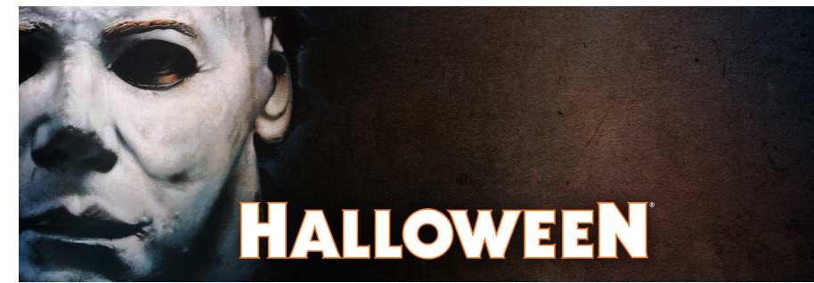
Universal's HHN begins this weekend | Page 3