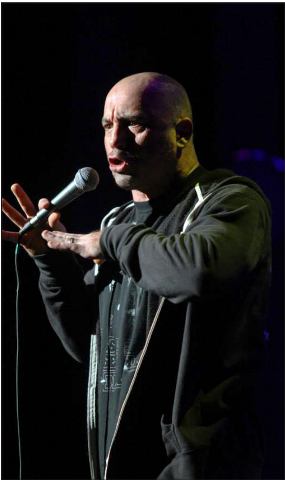
Hard Rock Live Joe Rogan performing at the Hard Rock Live, in Orlando, Fla., on April 18, 2014.