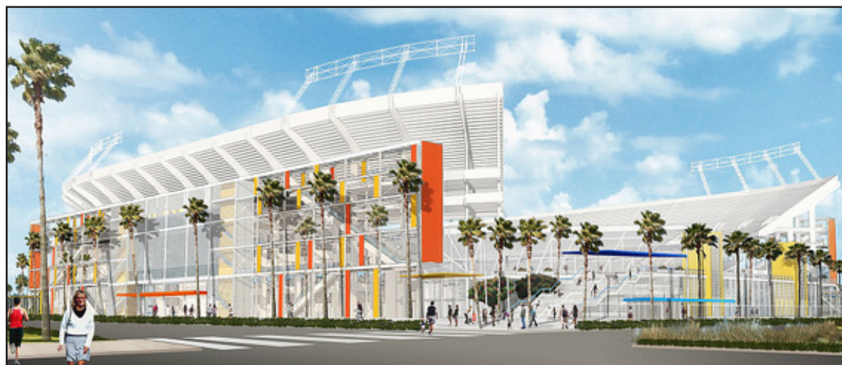
Florida Citrus Sports

Orlando City continues to make strides toward their future as an MLS team. The club will break ground later this year.