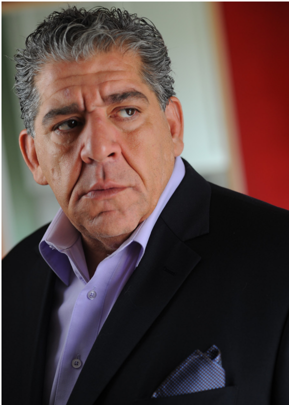
Joey “CoCo” Diaz hosts a bi-weekly morning video podcast called “The Church Of What’s Happening Now.”