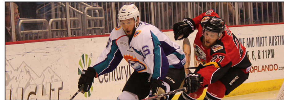
Solar Bears trail playoff series 0-2 | Page 9

— President Barack Obama to Oso, Washington landslide victims