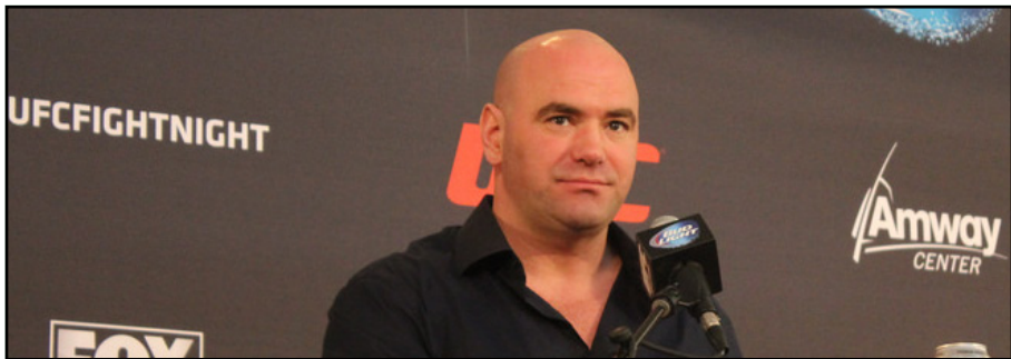
UFC takes Orlando by storm | Page 10