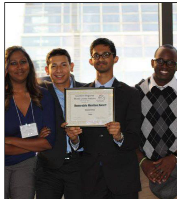
Did you know: West Campus' Model U.N. earned honorable mention at national tournament

Orlando City will play the entire 2015 MLS season in the newly renovated Citrus Bowl.