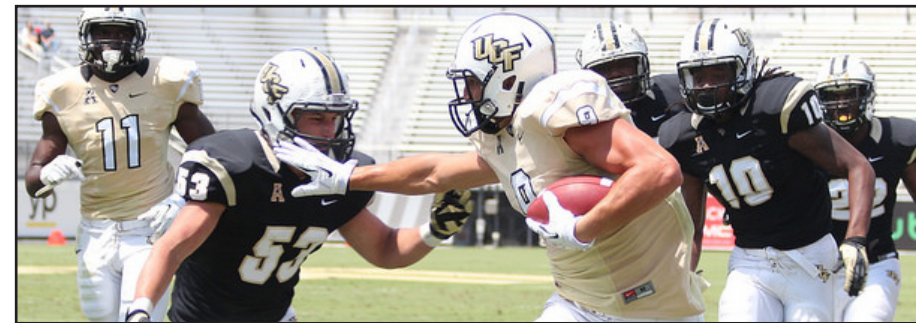
UCF wraps up spring football | Page 12

— President Barack Obama on Boston Marathon bombing survivors