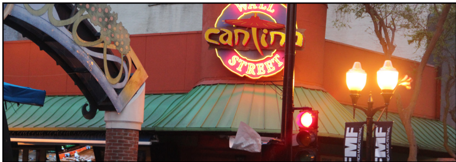
Downtown festival going on 14th year | Page 9