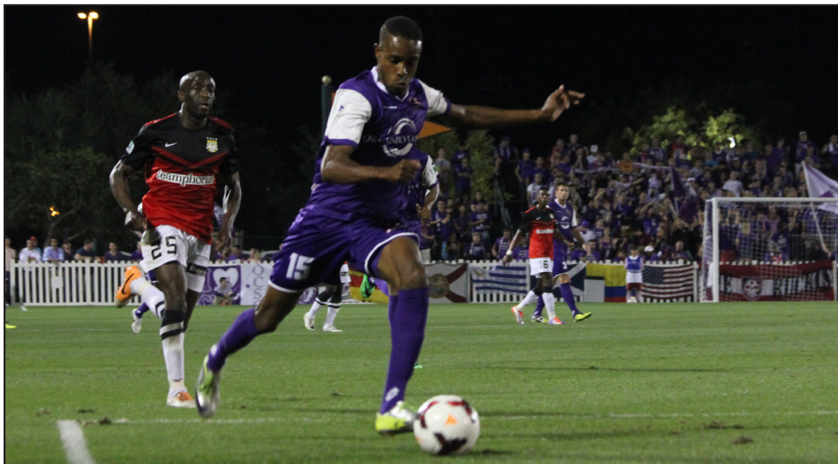
Bryce Brimhall / Valencia Voice

All of Orlando City's USL PRO matches can be streamed via their official Youtube page.