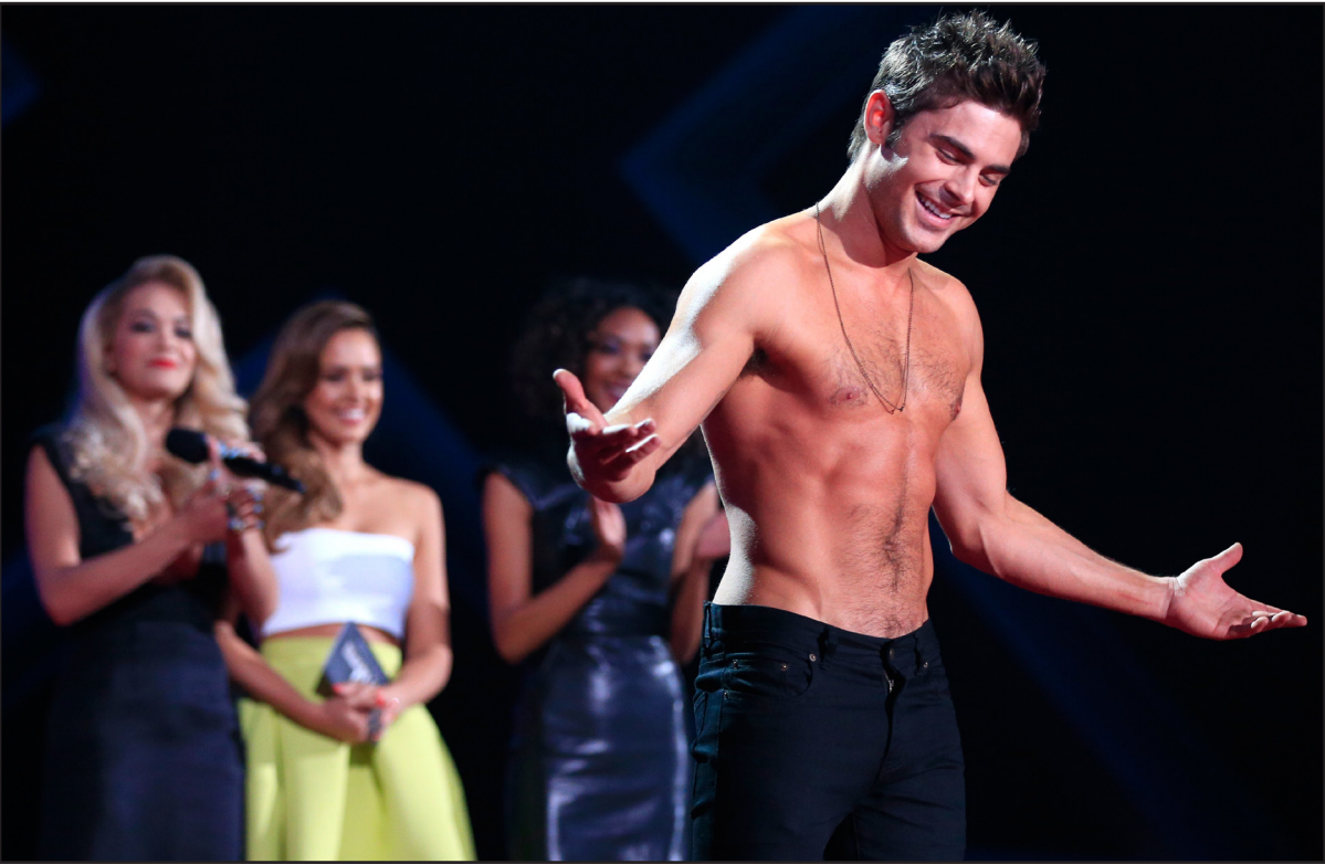
Zac Efron wins award for 'Best Shirtless Performance' in the film "That Awkward Moment."

Four out of the five nominees for male performance were not present. It was the fifth — Hutcherson of "The Hunger Games" — who won. Like many past editions, this year's show also aimed for viral popularity, with mixed results. After winning the prize for shirtless performance, Zac Efron took the stage and, after calls for him to remove his shirt, had it pulled off by presenter Rita Ora in what seemed like an arranged stunt. (An MTV representative declined to comment on whether it had been planned.) There were a sprinkling of serious moments amid the raucousness, including Jared Leto citing the AIDS crisis in his acceptance speech after winning best onscreen transformation for his role as a transgender person in "Dallas Buyers Club," and Jordana Brewster introducing a tribute to her late "Fast & Furious" co-star Paul Walker, with clips showing the actor's work both in movies and in philanthropy. Channing Tatum also gave a heartfelt talk after winning the trailblazer award. After Jonah Hill, his "22 Jump Street" costar, ribbed Tatum for blazing a trail as "a super good-looking guy who becomes the lead in movies," the star struck a tone of humility. "Ten years ago I was sitting in front of my TV watching this show," he said. "I didn't have the faintest thought I could actually be standing up here talking to y'all. I had no idea if I'd be good at anything, much less acting."