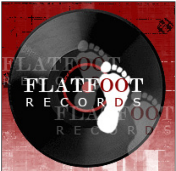
FlatFoot Records is a student run record company running on East Campus. Soon, they will launch a radio station open for student involvement.

For more information on the program, visit http://valenciacollege.edu/artsandentertainment/Musicandsoundtech .