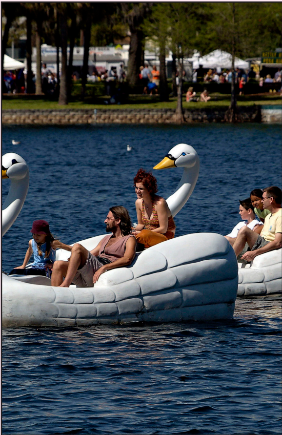
Swan boats create an iconic image on the waters of Lake Eola in the heart of downtown.