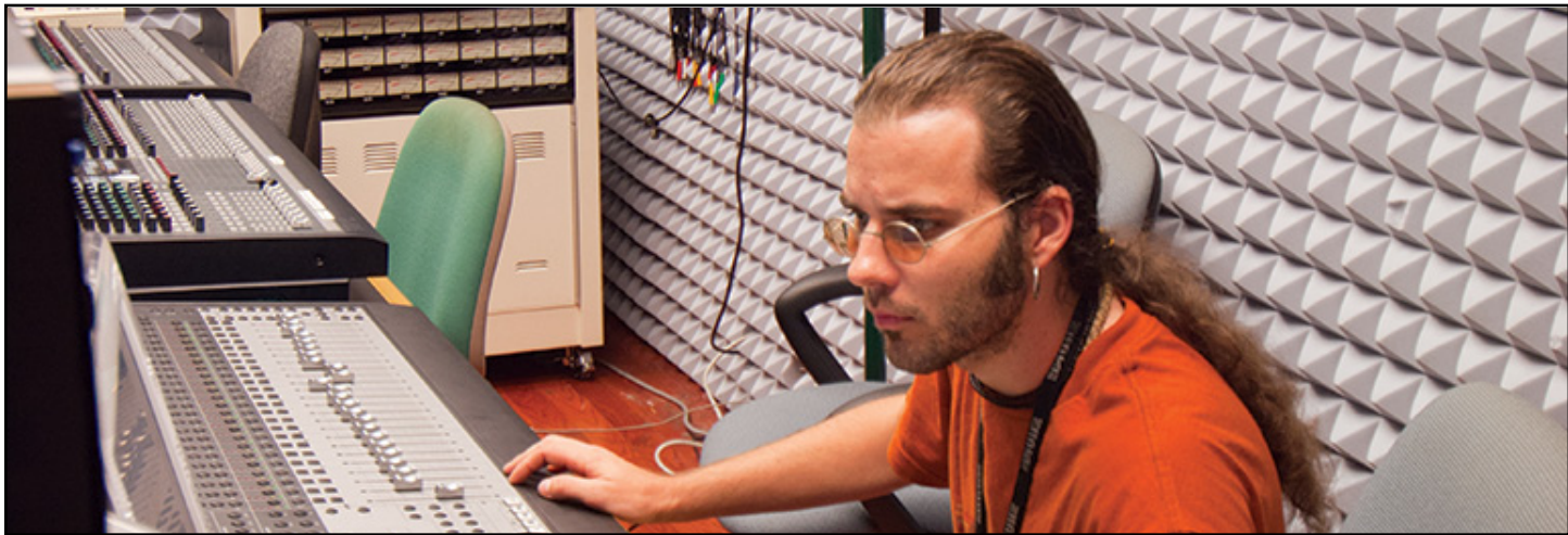
Courtesy of Valencia College East Campus house many of Valencia’s creative and performance programs, from technical theater production to film. Students have many opportunities to work on state-of-the-art production equipment, including sound boards and mixers.