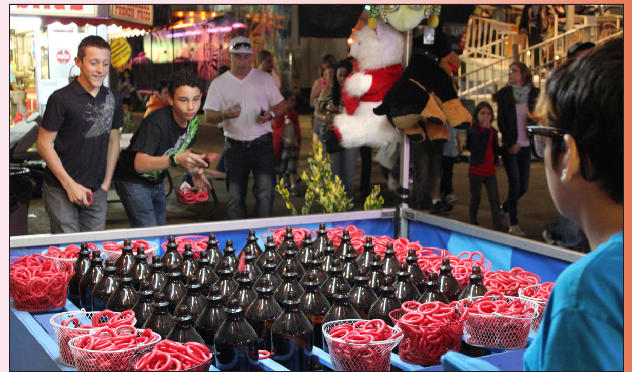
Above and below: James Tutten / Valencia Voice

The Osceola County Fair is located at Osceola Heritage Park, one mile west of the Florida turnpike exit 244 on Highway 192 in Kissimmee. Admission is only $5 for adults, so bring a date or your kids, as ages four and under are free of charge.