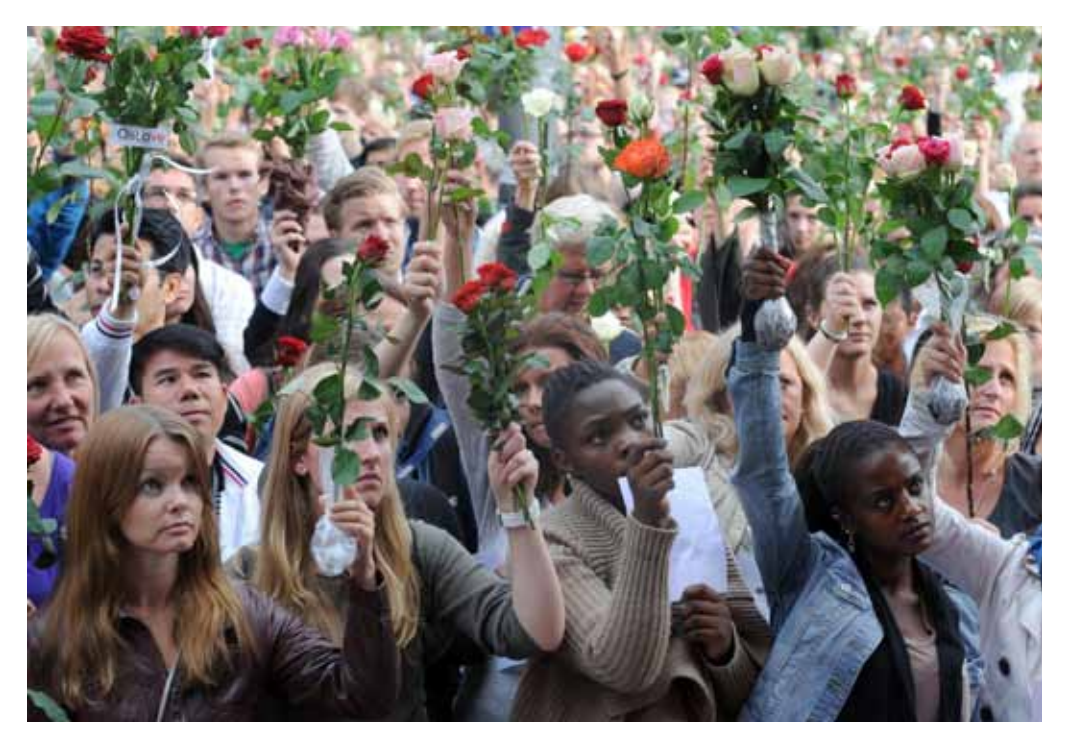
Residents of Olso gather to mourn victims of the July 22 massacre.

Under interrogation by police, Breivik admitted to both the bombing in Oslo, which killed seven people including two members of Norway's government, and a subsequent shoot-