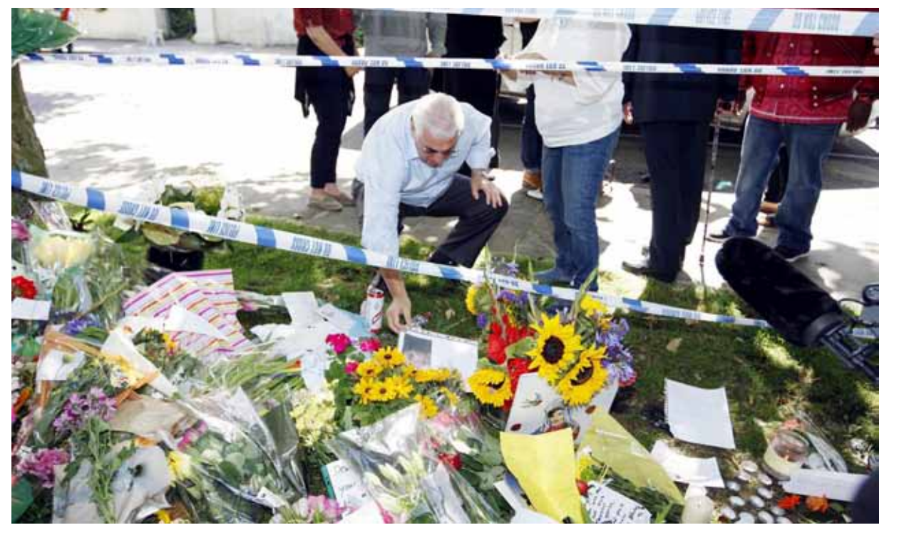
Mourners meet at the makeshift Winehouse mermorial site in London England

Winehouse continued to tour after her big wins, but the show was plagued with