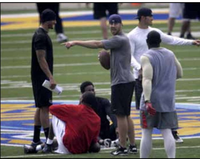
The San Fransisco 49er's held private pre-season camps.