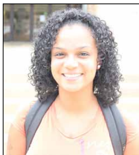
"I feel it's a personal choice, if you don't like it, stay away from the smoking areas."