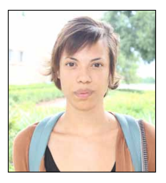
"It doesn't really bother me, I don't mind when others smoke. People do what they do."