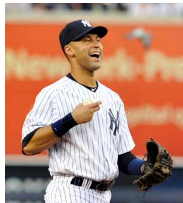
Derek Jeter cited exhaustion as his excuse.

The 82nd All-Star Game will take place at Chase Field, and the field will be full of impressive talent. But it's too bad we've spent so much time discussing who's not here.