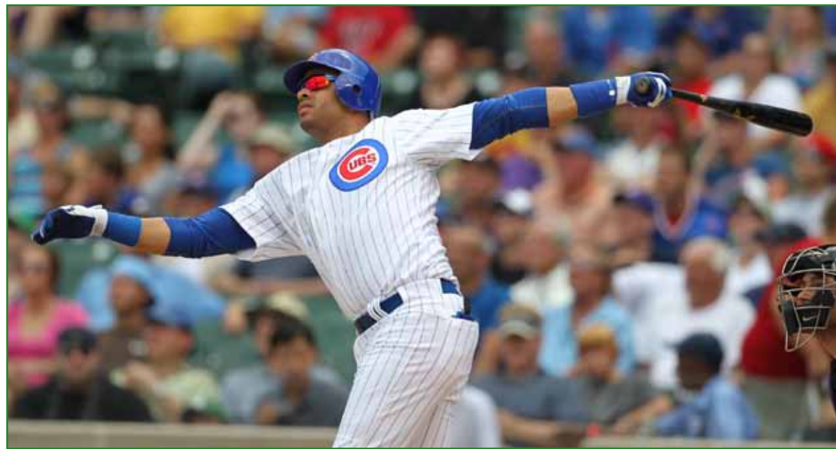
Aramis Ramirez, the Cubs' third basemen, will forgo the All Star Game this year.

The Arizona Republic reported today that 16 players pulled out of this year's game for various reasons. Derek Jeter apparently is too pooped to participate. The Cubs' Aramis Ramirez was asked to replace a player on the roster, but declined because