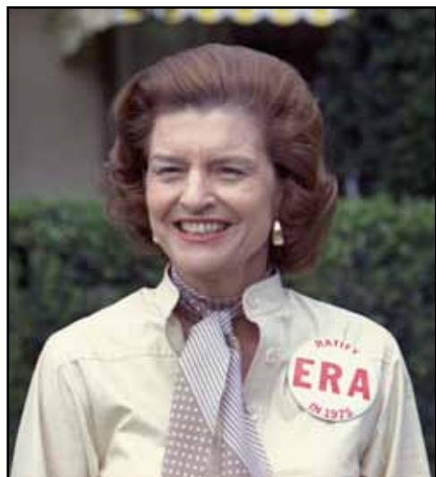
Betty Ford was a proud supporter of the Equal Rights Amendment, a progressive stance in the 1970's.

"Her honesty has always been one of the qualities about her that I love," Gerald Ford once remarked.