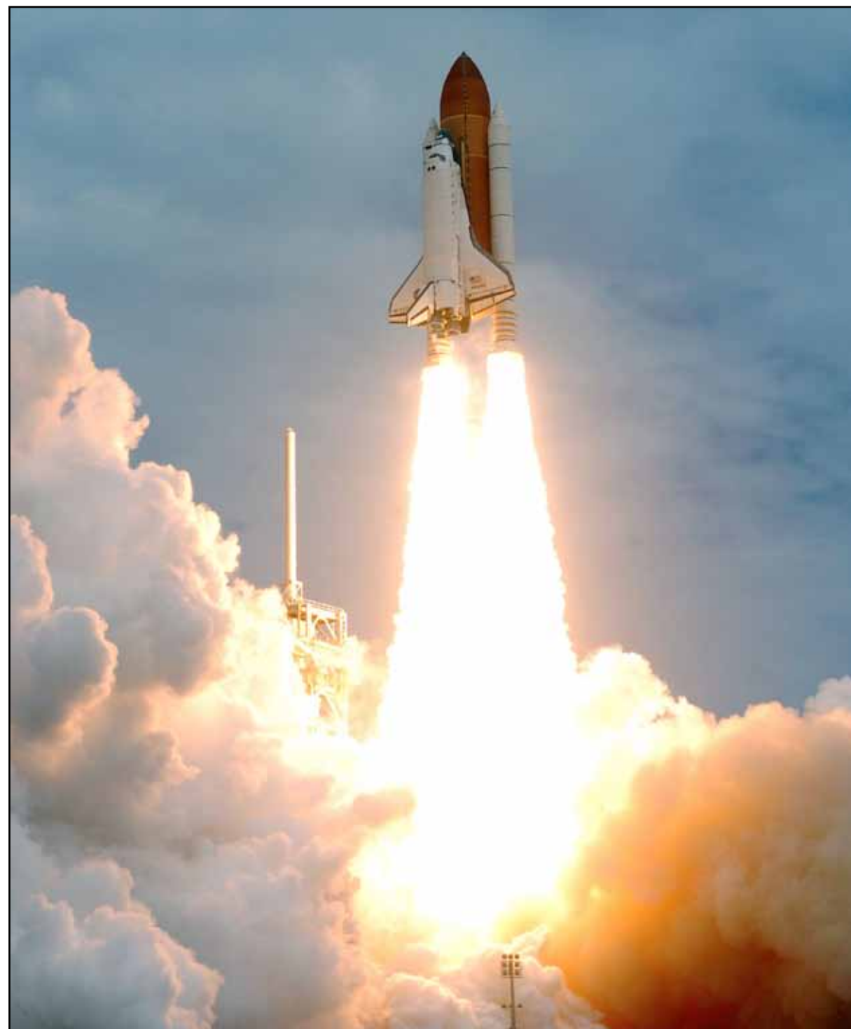
Atlantis rockets into space, the last shuttle mission of NASA's historic 30 year program.

Atlantis launched at 11:29 a.m., to the applause of thousands at Kennedy Space Center. Space Coast hotels reported one million visitors to the area for the weekend of the launch.