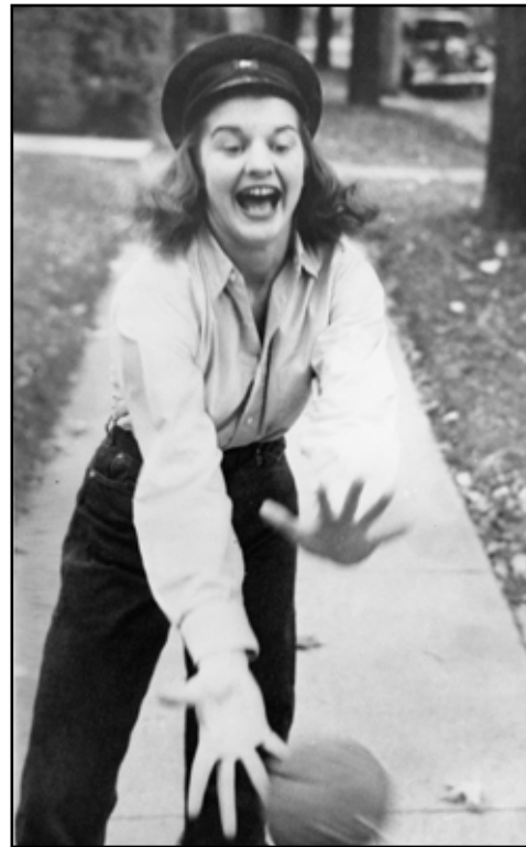
Ford was one of the most beloved First Ladies, revered for her candor, and down-to-earth personality.

"I got into a lot of problems with my children over that," Ford confessed during an ap-