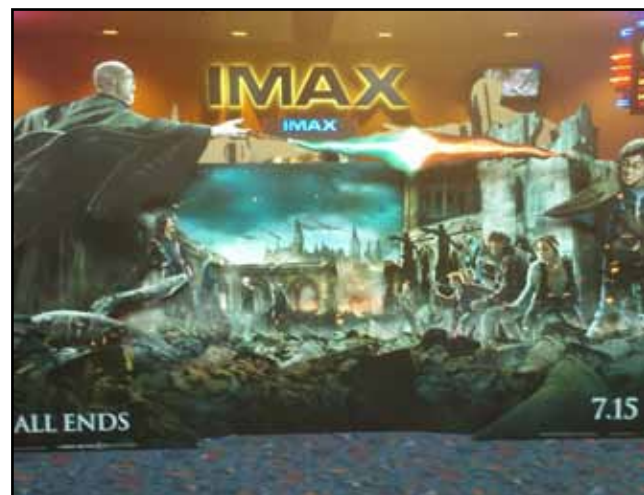
A Harry Potter display dominates the lobby of AMC Loews Cineplex at Universal's Citywalk.

The best theaters started preparing early with signs and banners, assuring that you will not be stuck in a small room with bad bulbs and out-dated sound.