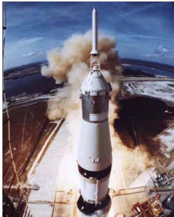
Apollo 11 rockets into space, carrying the men who will be the first on the moon.

July 16-20, 1969 Apollo 11 was launched on July 16, 1969. On July 20, it landed on the surface of the moon. Astronauts Neil Armstrong and Buzz Aldrin walked on the moon.