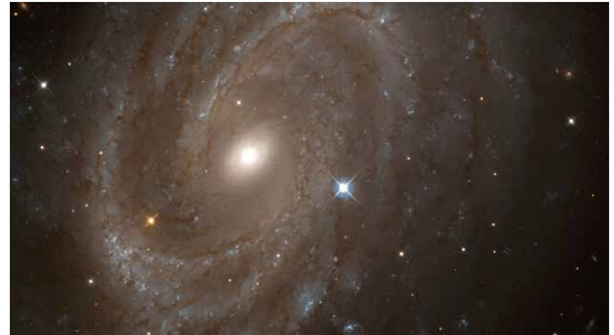
A photograph taken by the Hubble telescope, carried to space by the shuttle Discovery.

February 1, 2003 The Columbia's last mission ended when it broke apart during reentry of the Earth's atmosphere. The accident killed all seven astronauts aboard.