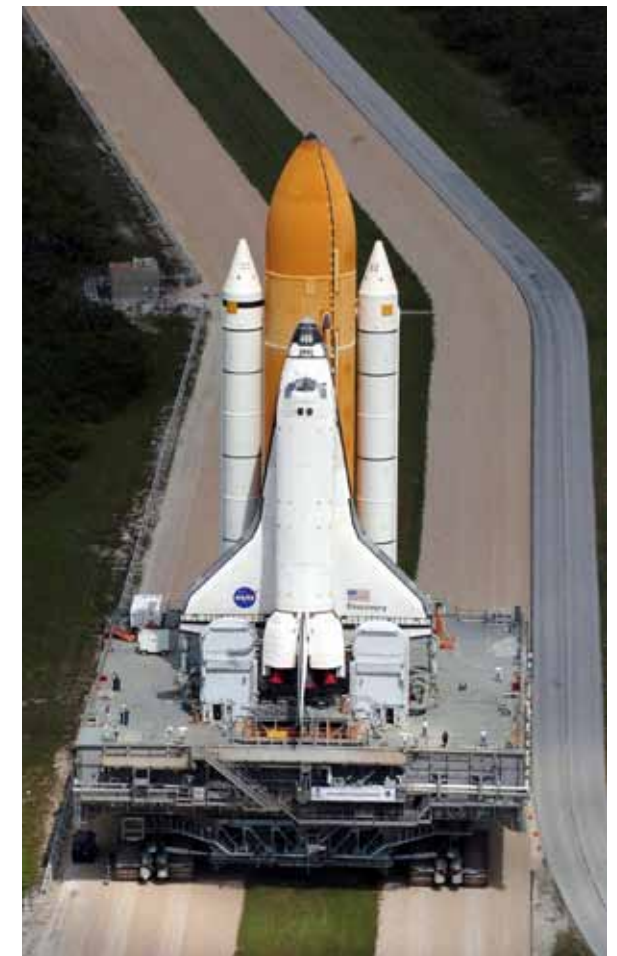
The space shuttle Discovery rolls out to the launch site, the first shuttle mission after the Columbia disaster four years prior.

July 8, 2011 The space shuttle Atlantis launched on its last mission, marking the end of 30 years of NASA's space shuttle program.