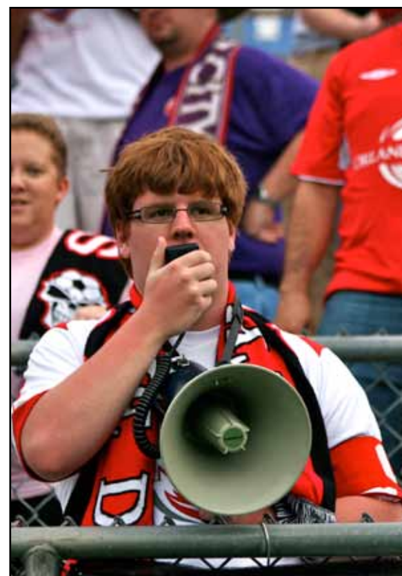
A fan uses a bullhorn to cheer on the Lions.