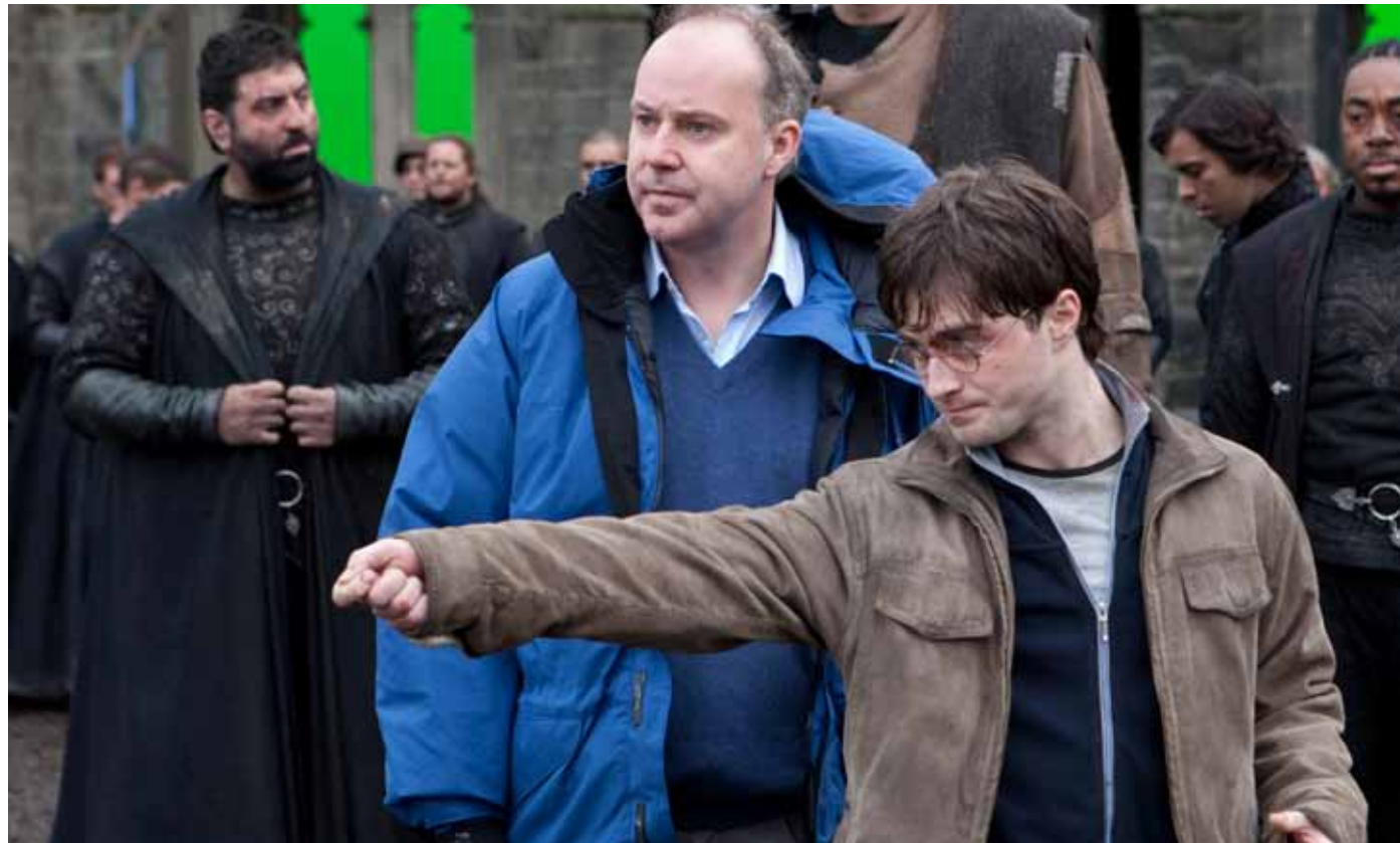
Danielle Radcliffe on the set with director David Yates. Top: Atlantis in the NASA hangar.

In these uncertain times, we need a respite, an escape. It is these brief moments of suspended disbelief that we revel in, that allow us to find peace in a tumultuous world. Fantasy is essential to dealing with a harsh reality, and that is why we continue to consume such treasures as Harry Potter, and what enables us to keep changing the world.