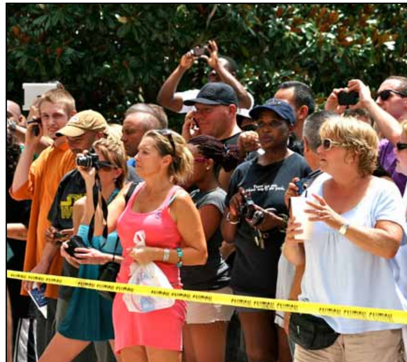
Police tape hold back spectators waiting to capture images of attorneys leaving the courthouse.