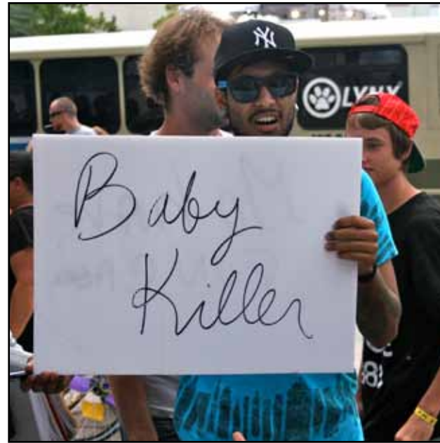
A passionate citizen argued with media and onlookers about Casey's guilt.