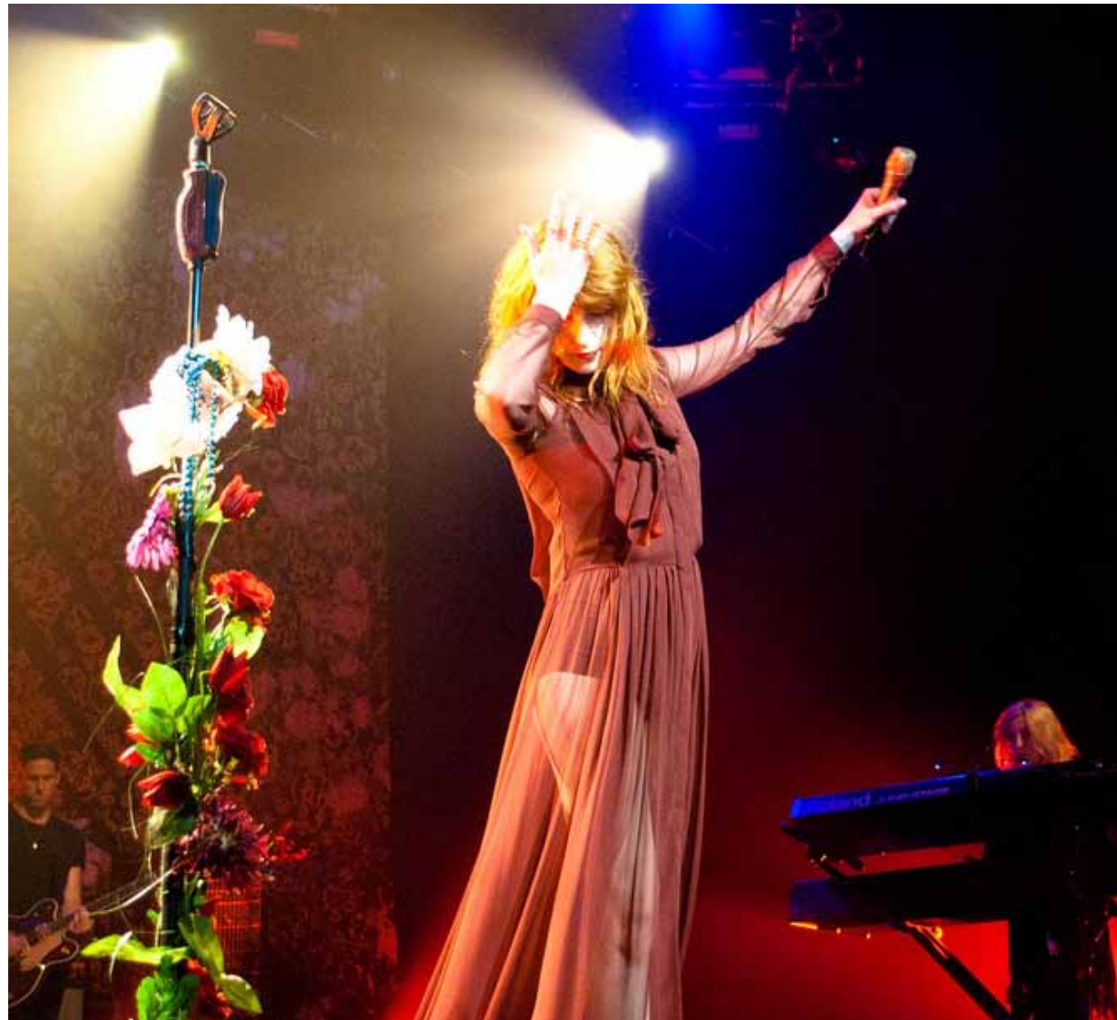
Lead singer Florence Welch pauses dramatically during her June 30 concert.