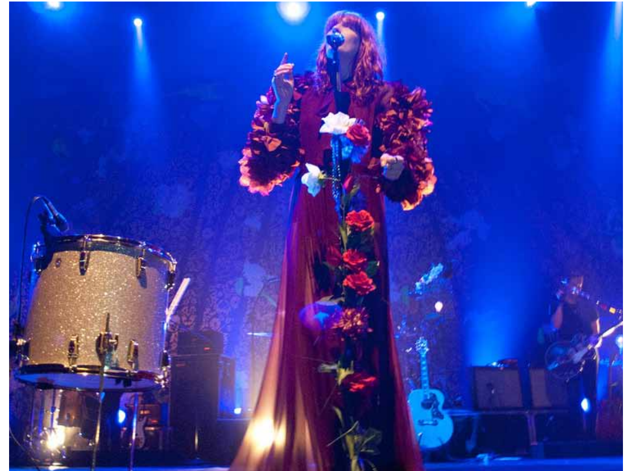
Florence and the Machine debut album “Lungs” reached number one in the UK.

The concert also gave the band the opportunity to showcase songs from their forthcoming sophomore album. Starting with the six minute track entitled “Strangeness and Charm,” the band set another change in sound. With a heavy guitar riff and powerful harmony,