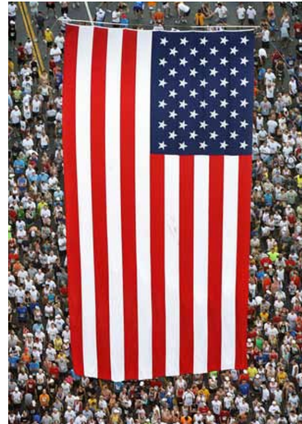
July 4th festivities bring out record crowds to show love for their country

Washington would have lost his mind if he even suspected the Citizens United decision would even be considered. Jefferson would chew on his own hat if he had known of the necessity of unions and the current trend of destroying them. And Franklin would give a simple "I told you so," about the whole mess.