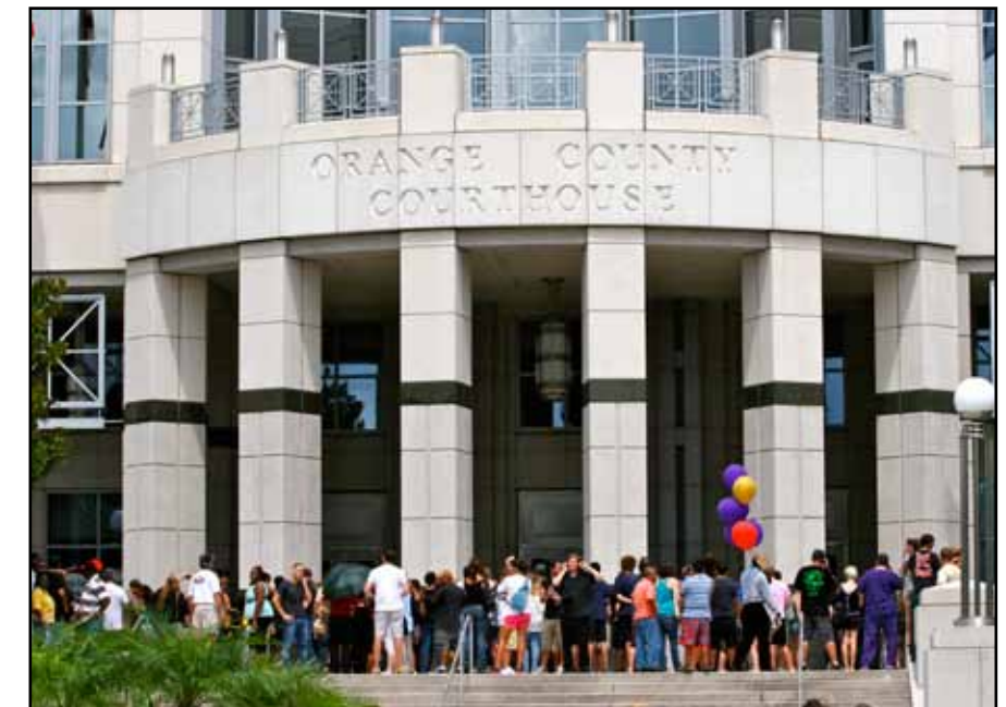
A large crowd gathered in front of the Orange County Courthouse on Tuesday in anticipation of the verdict.