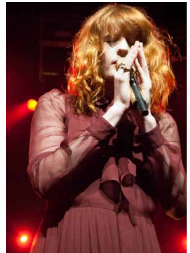
Florence is known for her strong vocals

With a strong conclusion to the concert it was clear that fans got what they had expected proving why an international band such as Florence+ the machine has gathered such a strong fan base and critical acclaim.